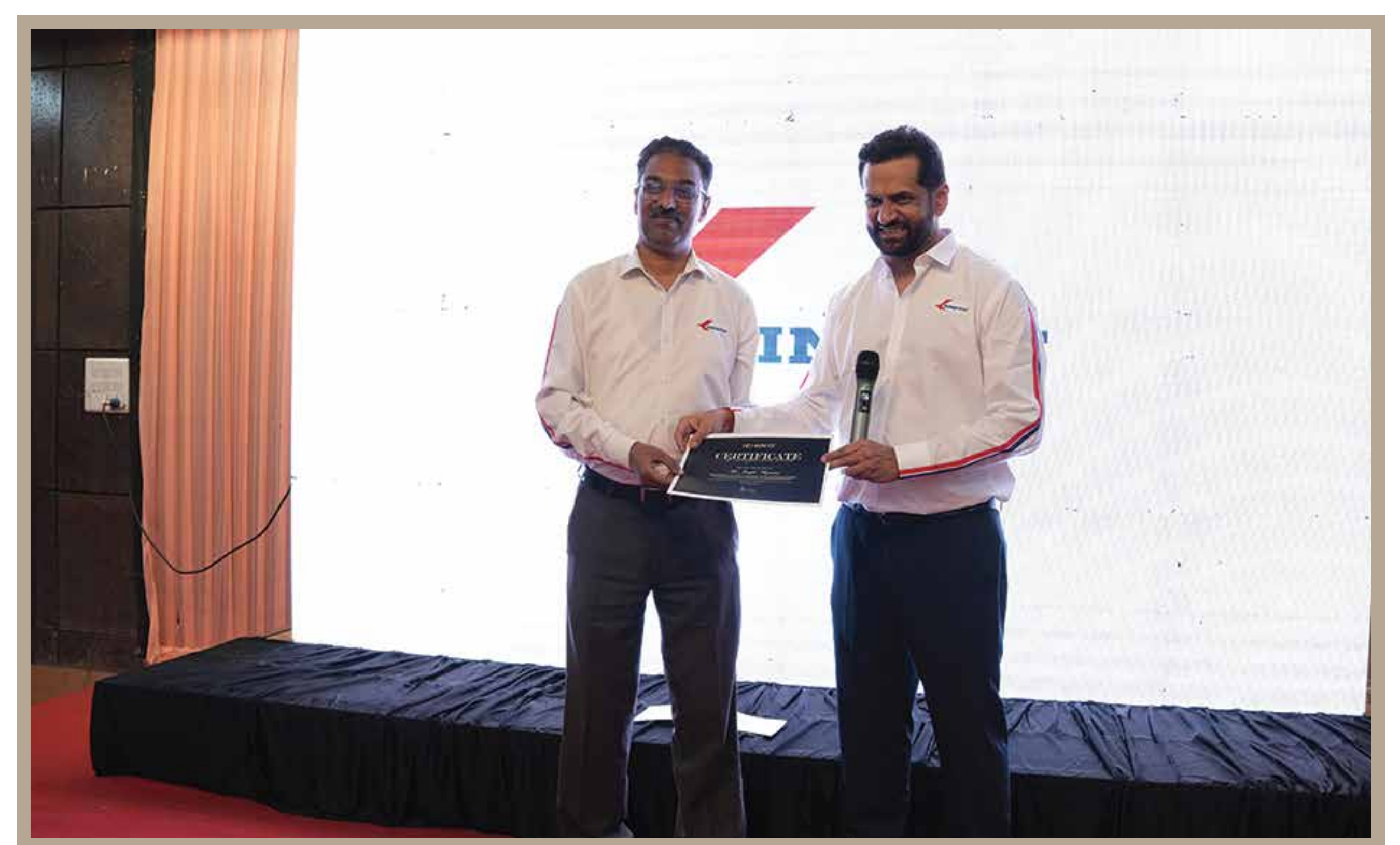
VC sir recognising the excellence award