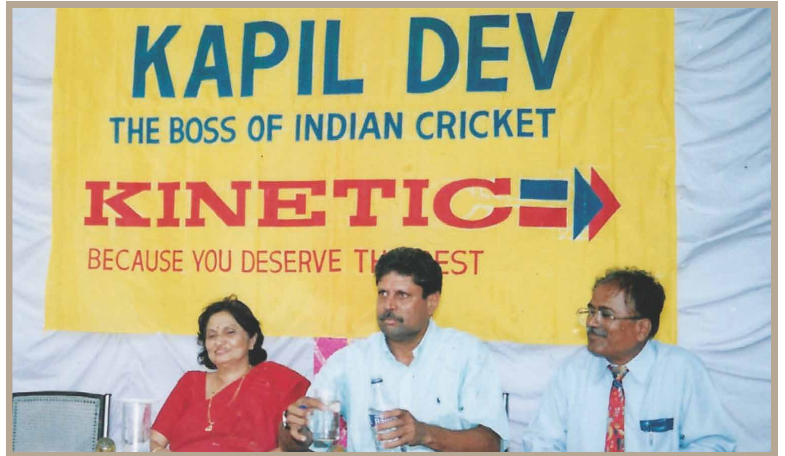
Kapil Dev endorses Kinetic legacy

In the early 2000s, as India's two-wheeler market evolved rapidly with fierce competition and rising consumer aspirations, Kinetic Engineering Ltd., one of the original pioneers of personal mobility in India, was preparing for a remarkable comeback. Known for its spirit of innovation and commitment to empowering Indian commuters, Kinetic was poised to re-enter the mainstream motorcycle segment with renewed energy and ambition.