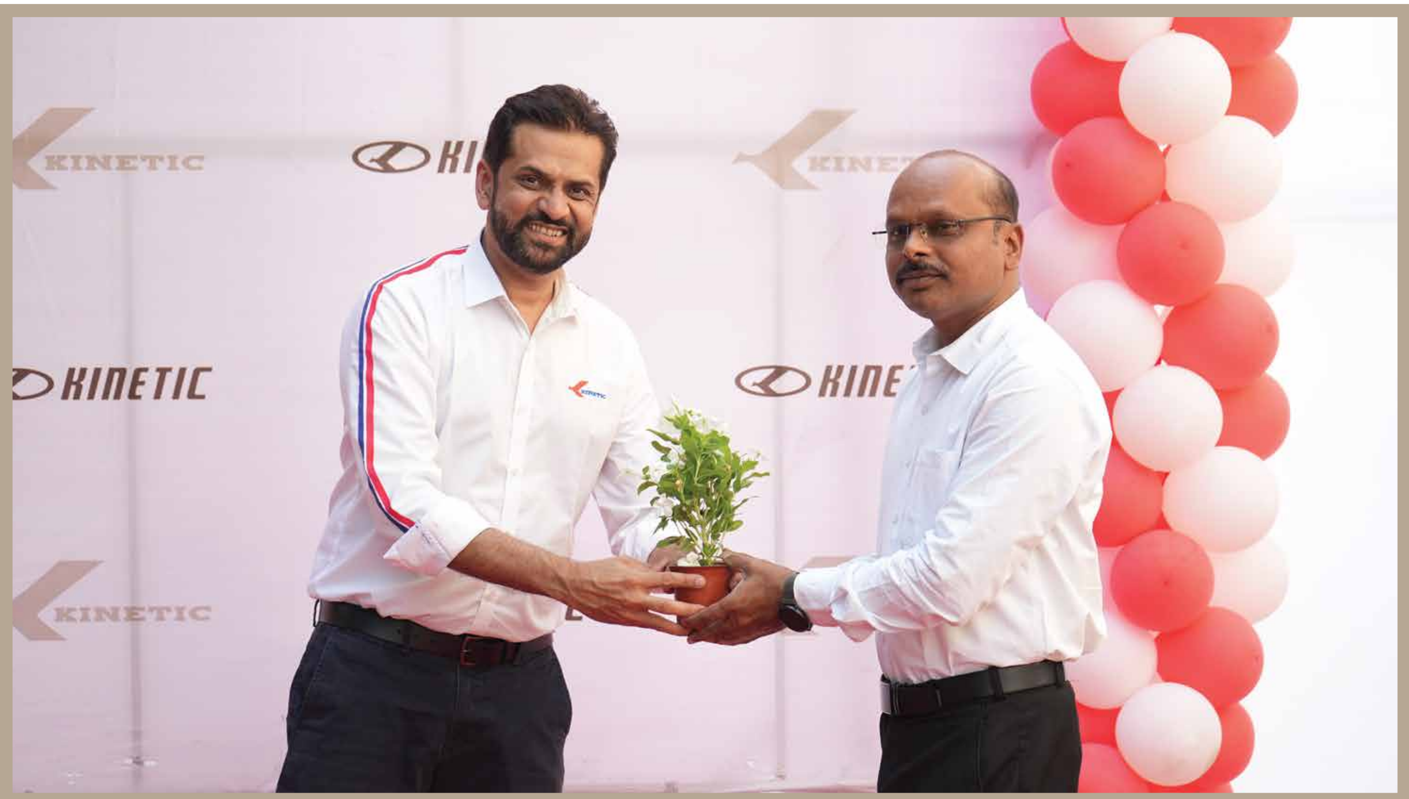
Employee recognition by VC sir