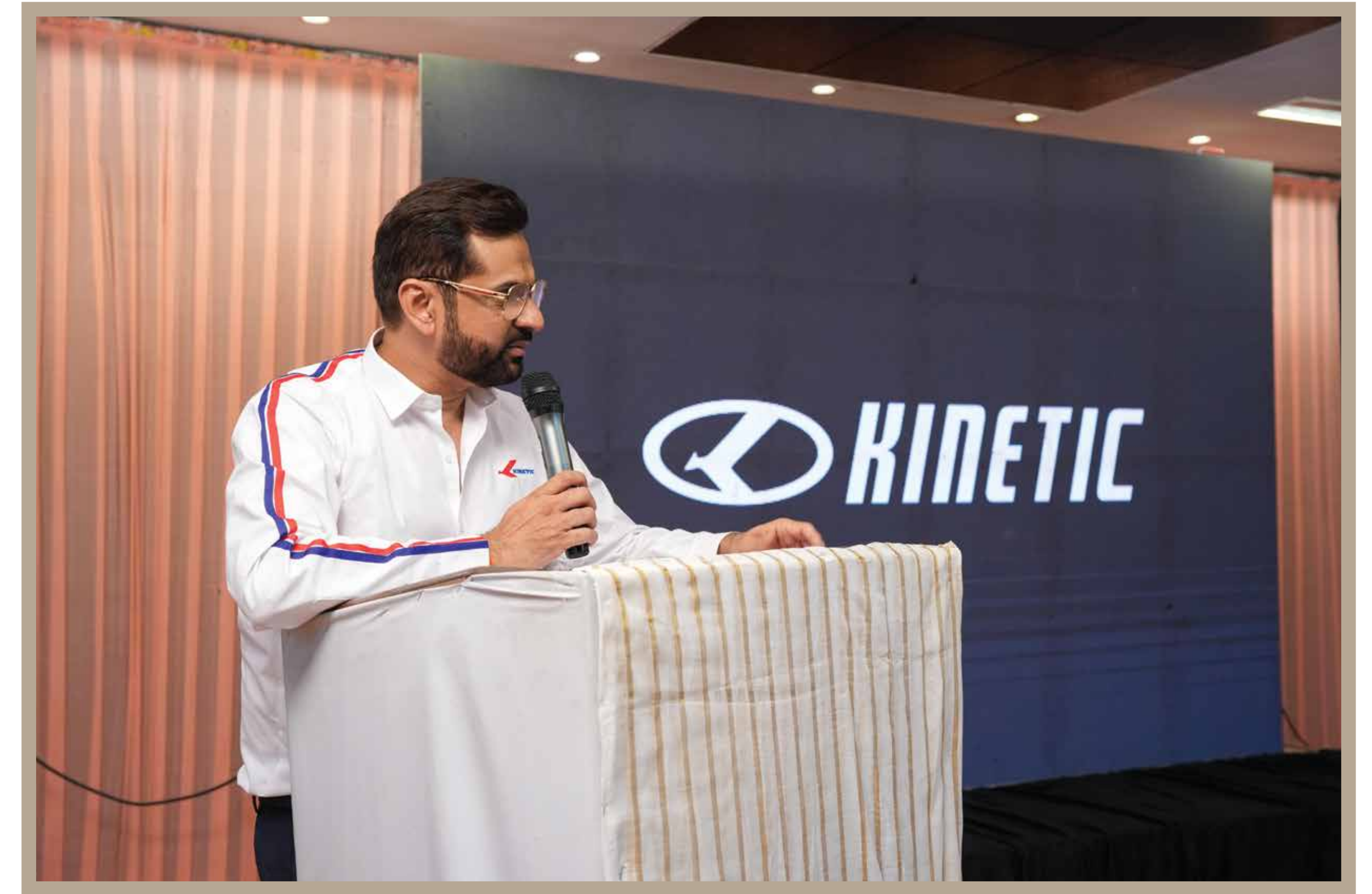
VC sir addresses employees at Kinetic awards

This month, the Kinetic family gathered for a special occasion: The Kinetic Awards Ceremony. It was an evening dedicated to honouring not only individual achievements but the enduring spirit of teamwork and the deep relationships that have powered our journey over the years.