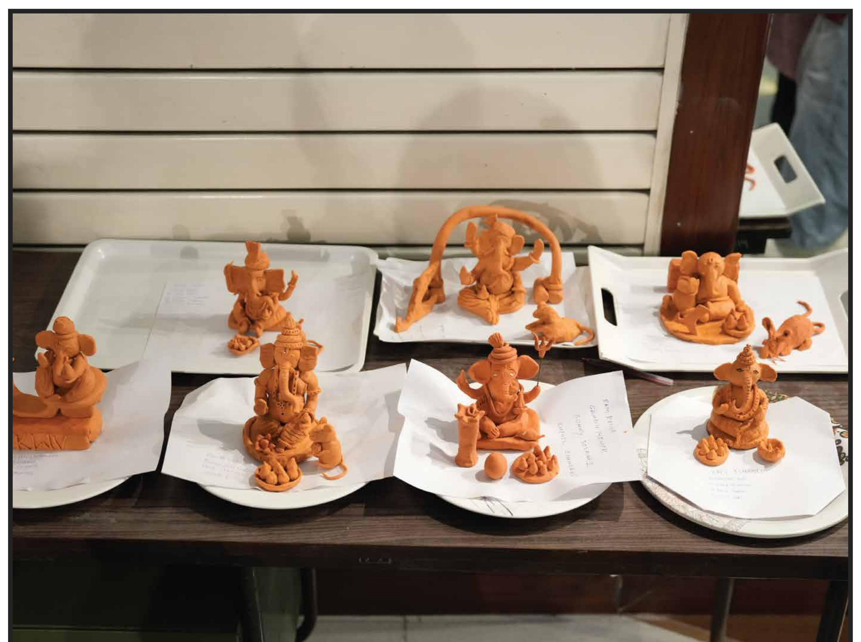
Employees showcasing their creativity in the Ganapati-making competition