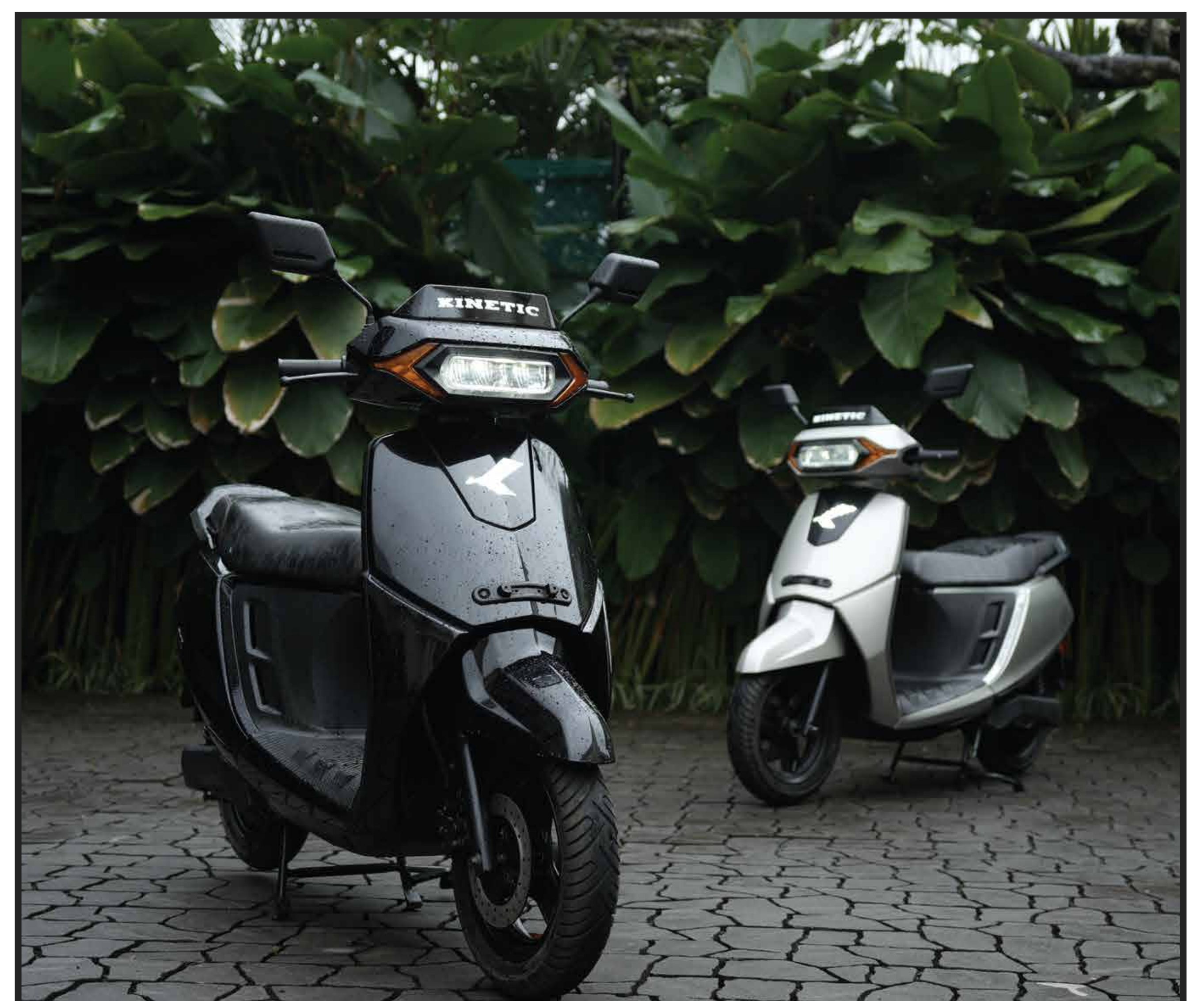
The all-new Kinetic DX – reborn in electric avatar