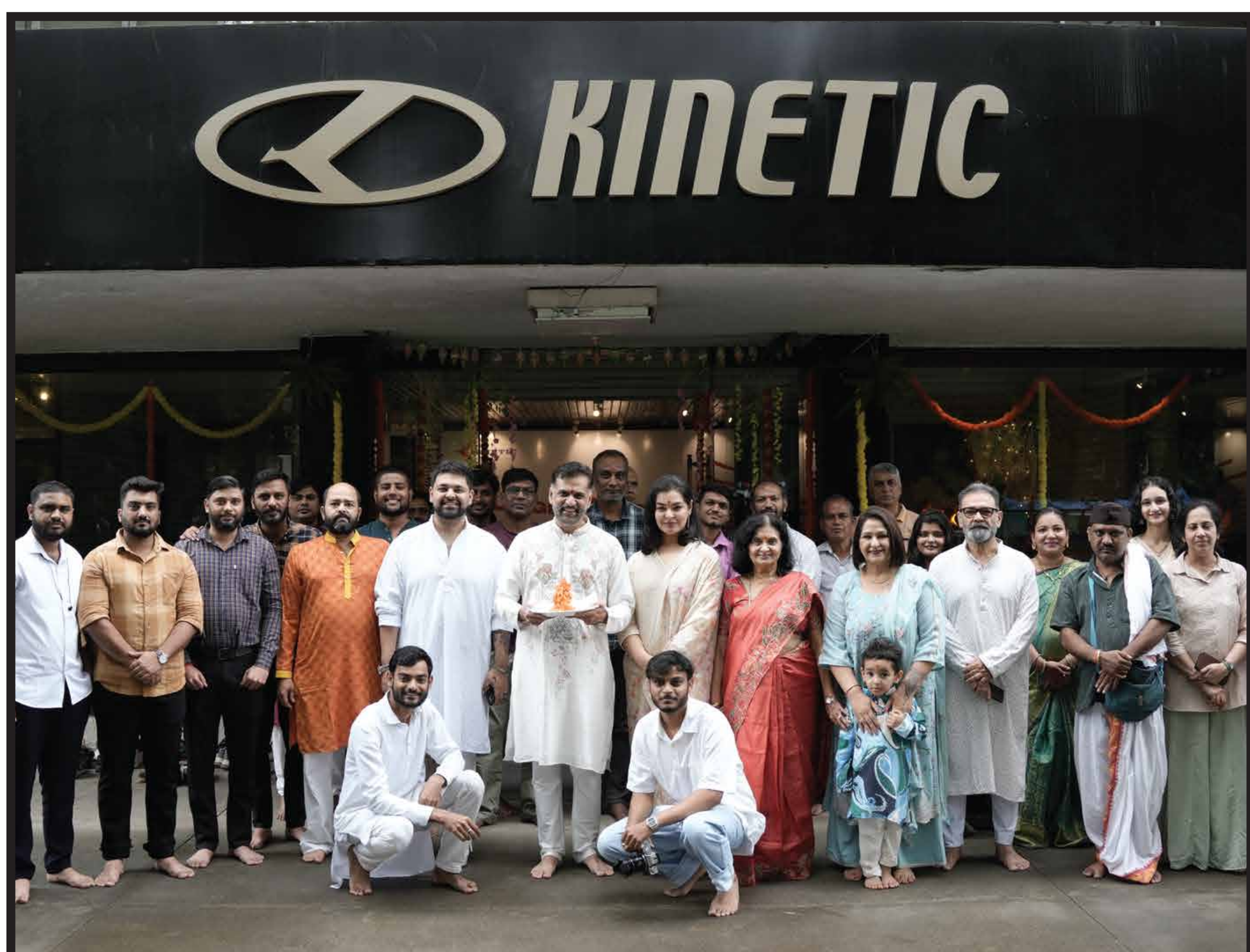
The Kinetic family celebrating Ganesh Chaturthi together