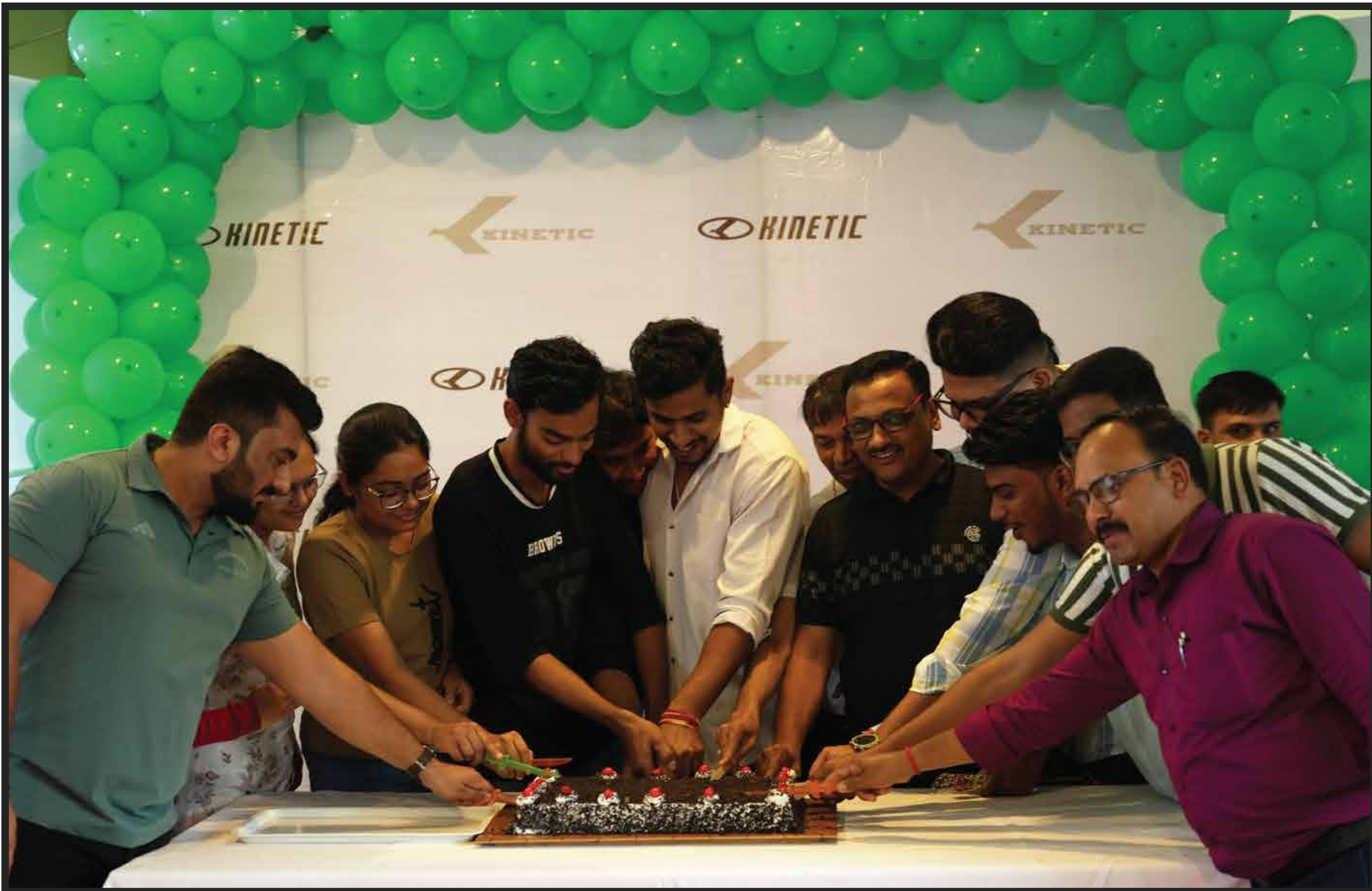
Kinetic employees celebrating their Birthdays